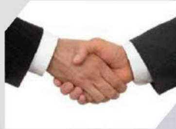
Obtaining client's consensus on scope responsibilities