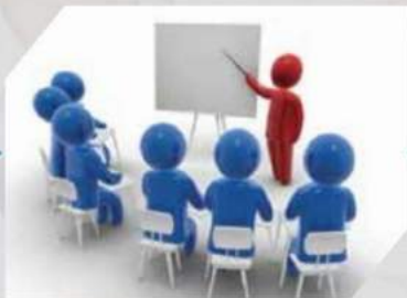
Orientation and training