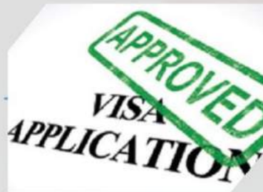
Entry visa application