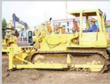
Heavy Equipment Operator: Backhoe Operator, Excavator Operator, Bulldozer Operator, Loader, Grader Operator, Crane Operator, Power Shovel, Roller Operator, Asphalt Paver Operator