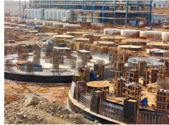
Obi Nickel Colbat Project, Indonesia