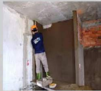
Building Workers: Concreting Worker, Scaffolding Worker, Tiller, Mason, Plasterer, Bricklayer, etc