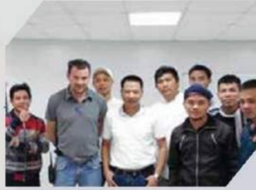
Overseas employment management