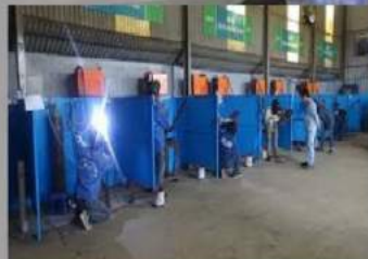
Welder: TIG, MIG Welder, 2G, 3G, 4G, 6G Welder