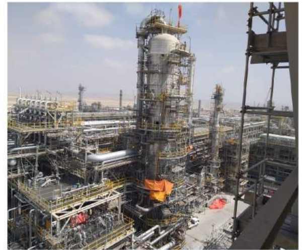
Duqm Refinery Project