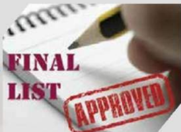
Sending list of successful candidates to client for finalization