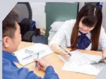
Recommending domestic & overseas job opportunities