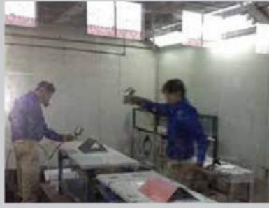
Painter: Wall Painter, Spray Painter