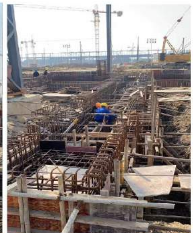
One Belt One Road Project, Indonesia