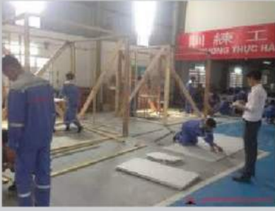
Carpenter: Building Carpenter, Furniture carpenter, Shuttering carpenter