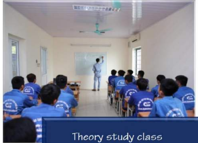
Theory study class