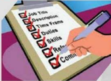
In-depth assessment of client's staffing needs

Every business is different, and so the employees you hire. Still, we believe that with our strict recruitment procedure, you can find your perfect candidates. The result-focused process from beginning to end is thorough, methodical and organized.