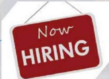
Job advertisement, sourcing candidates from our database, training centers