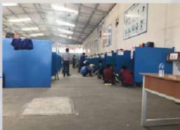
Facilitating shortlisted candidate's interview and trade test with clients