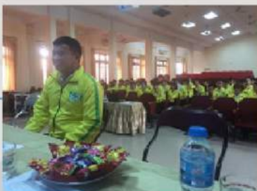
Evaluating candidates by conducting preliminary interview