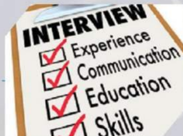
Specific feedback from client and feedback to candidates