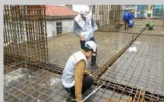
Steel Worker: Steel Fixer, Steel Erector, Steel Metal Worker, Iron Worker