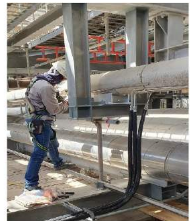
Hayadh & Hawiyah Field Gas Compression Project