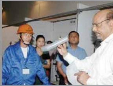
Fitter: Pipe Conduit, Mechanical