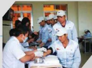
Second medical checkup