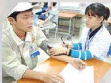
First medical checkup